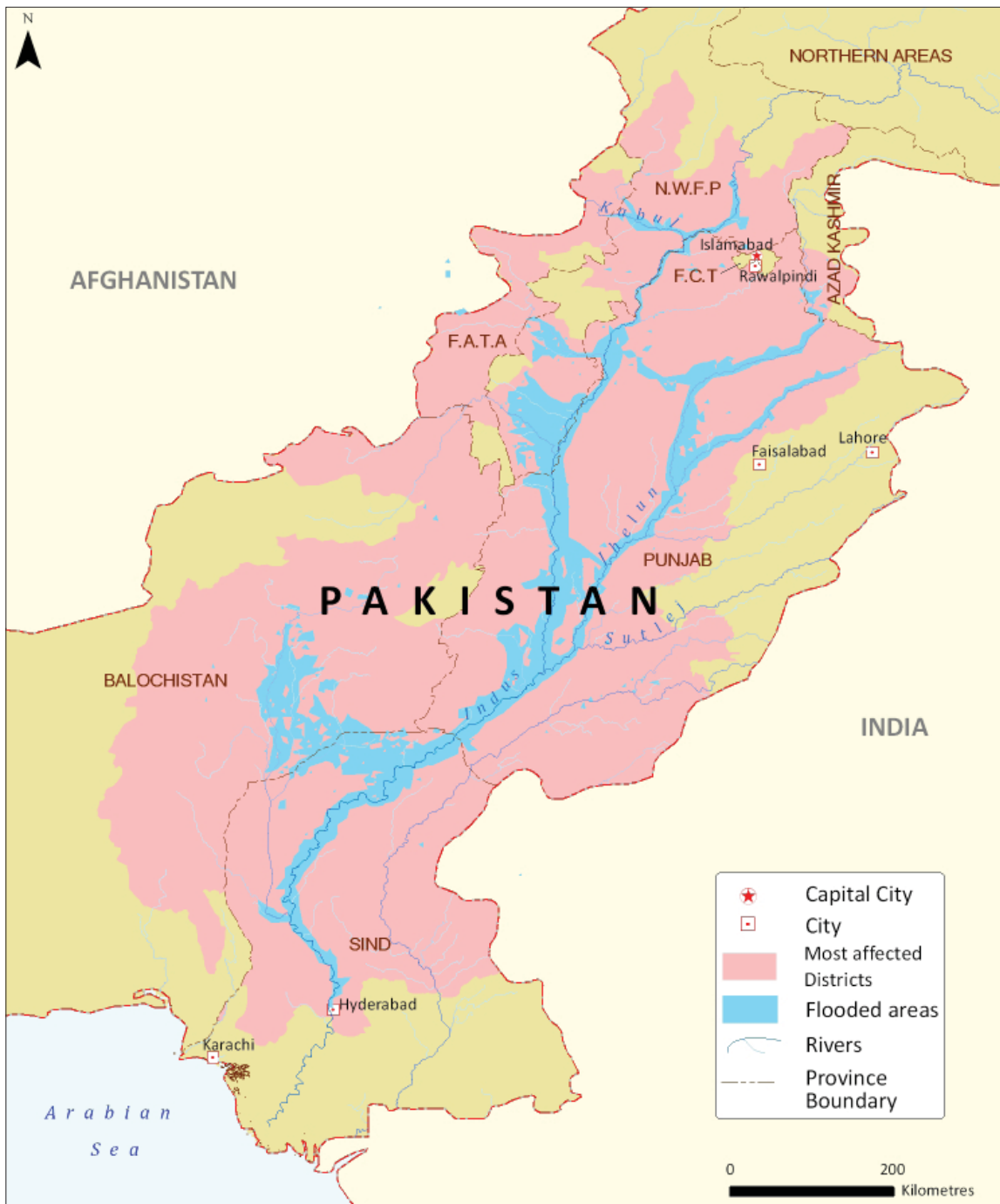
Figure 1: The districts affected by the Indus flooding. The flood wave initiated by the heavy rains can be tracked by river gauges as it perpetuates downstream (Source: OCHA 2010).

The issue is a significant environmental disaster, since the area is primarily based on an agrarian economy. Some 6 879 655 ha of agricultural land have been submerged. In the Punjab alone, almost 404 685 ha of cotton-growing land was affected. The flood-affected lands could lose their crop and livestock producing capacity, with severe long-term impacts on both the environment and livelihoods. In addition, the floods will force more people to move to already crowded urban areas.