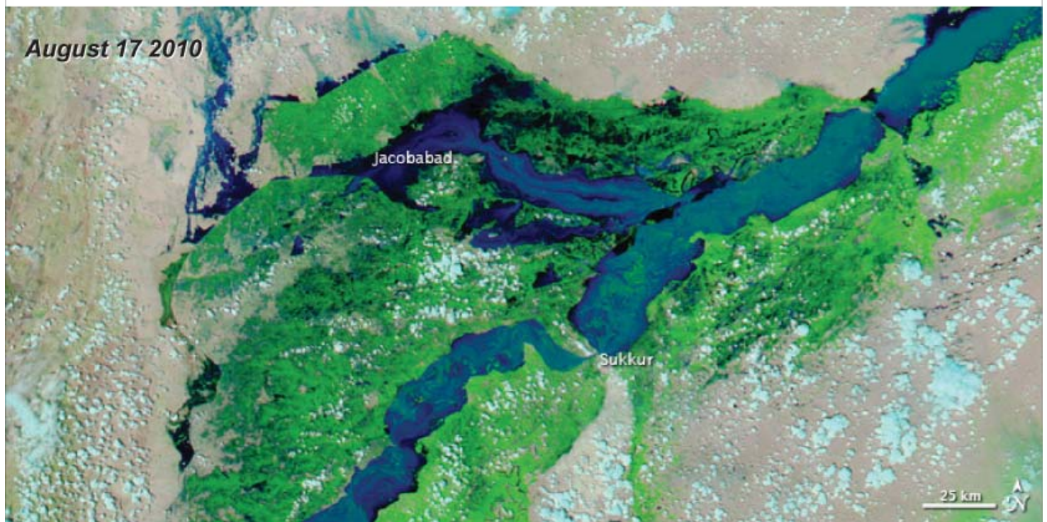
Figure 2: Satellite imagery (MODIS Terra) showing the extent of the flooded area in the worst affected area around the city of Sukkur (bottom, acquired 17 August 2010) in comparison to the river water one year earlier (top, acquired 18 August 2009). Note that clouds appear as turquoise-white.