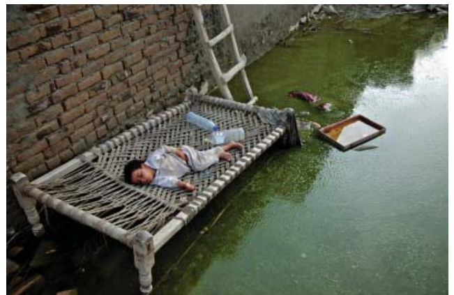
A child sleeps on a bed surrounded by floodwater in his home in Khwas Koorona Village, Pakistan. An estimated 2.5 million of the province's 3.5 million residents have been affected by the disaster.

In 2009, the Food and Agriculture Organization of the United Nations (FAO), the World Food Programme (WFP), and the National Disaster Management Authority (NDMA) conducted a pilot project to strengthen response to riverine floods and hill torrents in the Rajanpur (Punjab) (FAO 2009). This newest disaster, however, overwhelmed domestic, NGO and UN response capacities. A lesson learned from the disaster is that although such events are rare and unpredictable, there is a need for renewed and up-scaled disaster preparedness, especially in light of the potential impacts of climate change on flooding patterns.