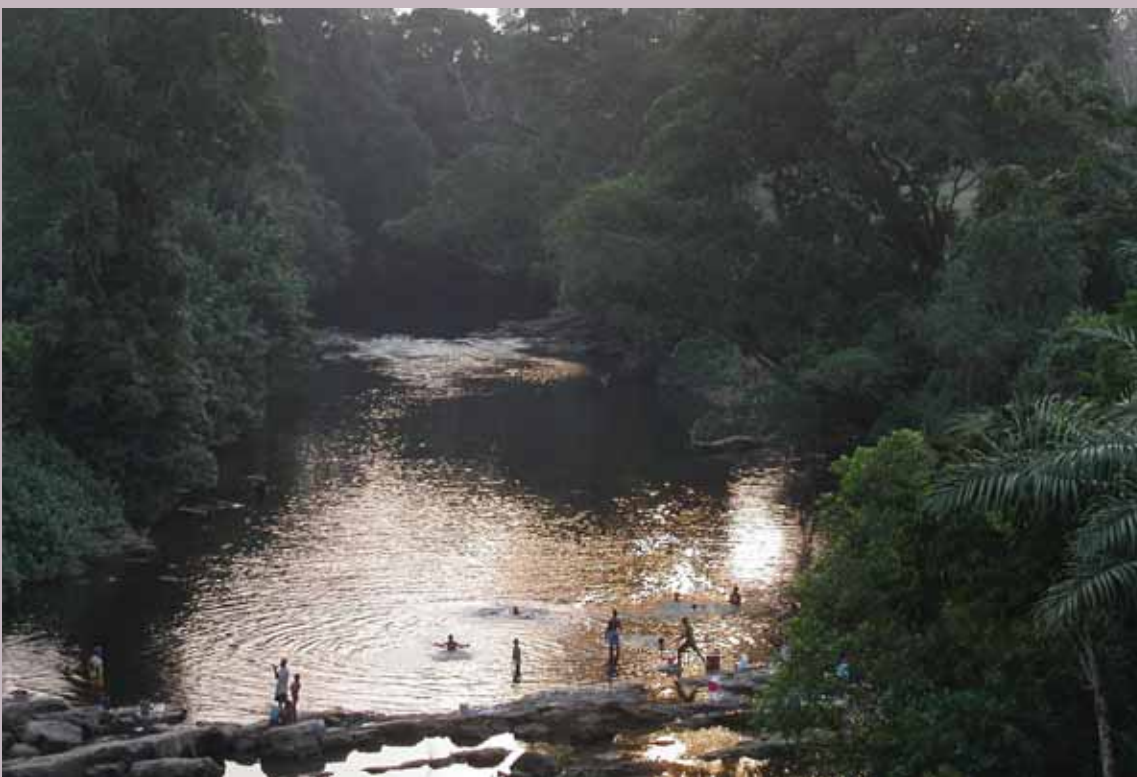
People washing and swimming in a river, a common means of Schistosomiasis transmission from snail to human hosts, often with serious health consequences.

The body's immune system recognises that the eggs of the fluke are foreign invaders and tries to destroy them. The side effects of this powerful immune response include anaemia, inflammation, formation