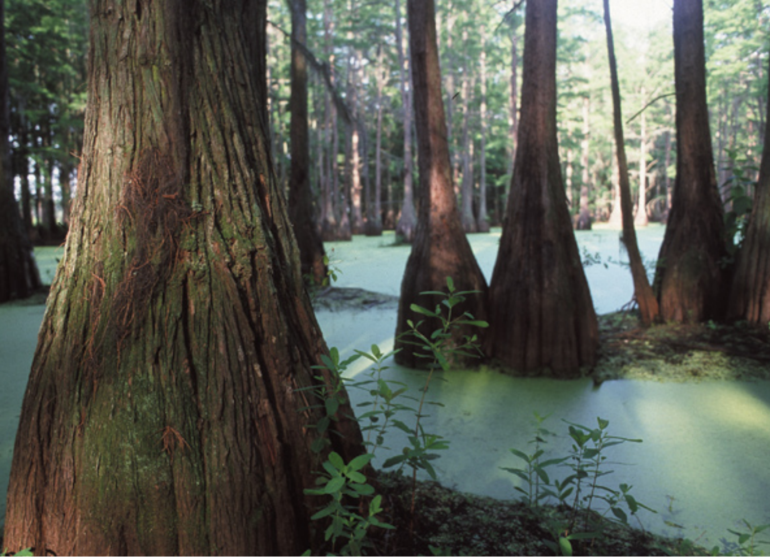
This cypress bay is a haven for many different species of wildlife.